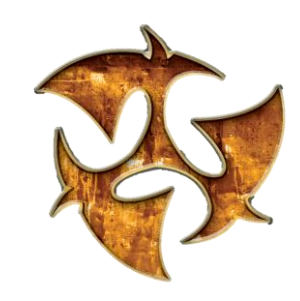
*Northkin – Storm of the North