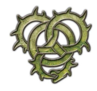
*Tharn – Devourer's Host