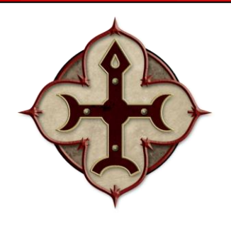
*Exemplars – Final Interdiction