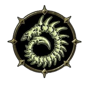
*Banes – Dark Host