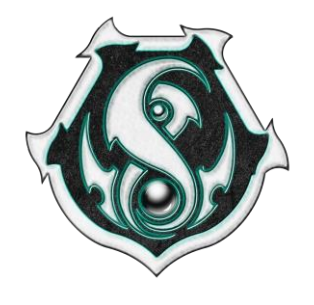
*Dawnguard – Legions of Dawn