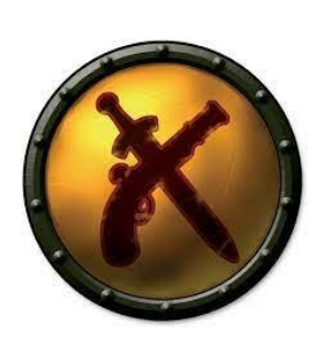
Gatormen – Blindwater Congregation Steelheads – Soldiers of Fortune