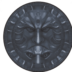
THE BLACK PENNY TOKEN

PERMISSION TO PHOTOCOPY FOR PERSONAL USE ONLY.