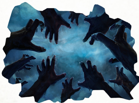
HANDS OF THE DEAD TOKEN