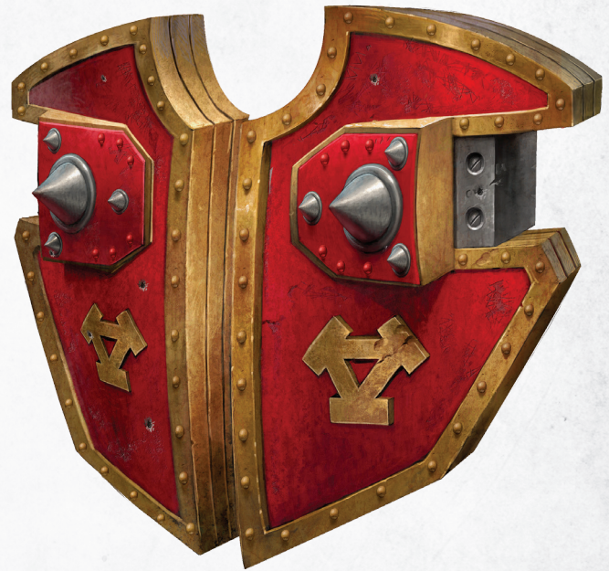
Tanker Tower Shield